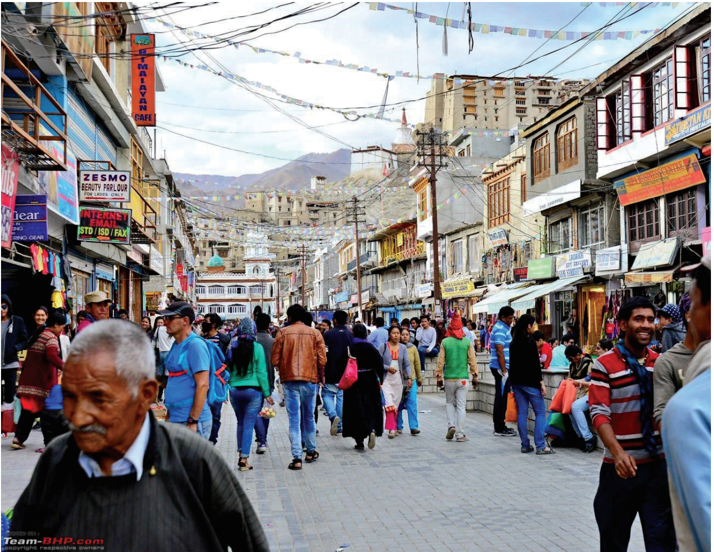
The main market in Leh town was given a face-lift as a part of the Leh Beautification Project few years ago. As a result, the whole market area has been pedestrianised.

Leh, like other Indian cities and towns, is experiencing rapid urbanisation thereby creating new challenges of infrastructures, urban design, and housing, as well as urban ecology. Urban modifications have considerably altered the appearance of Leh over the last few years. The beautification project in Leh is concentrated in and around the main bazaar and currently is the most visible and powerful instrument shaping the urban space. It is a subproject under the national “Urban Infrastructure Development Scheme for Small & Medium Towns” (UIDSSMT, Ministry of Urban Development 2009).