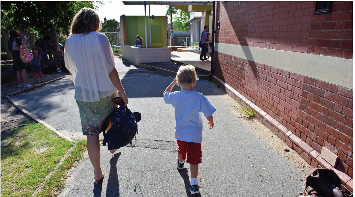
Transport on the Monash freeway in Melbourne.