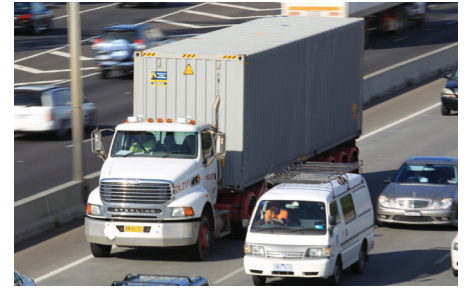
Page 4 Smart City Page 8