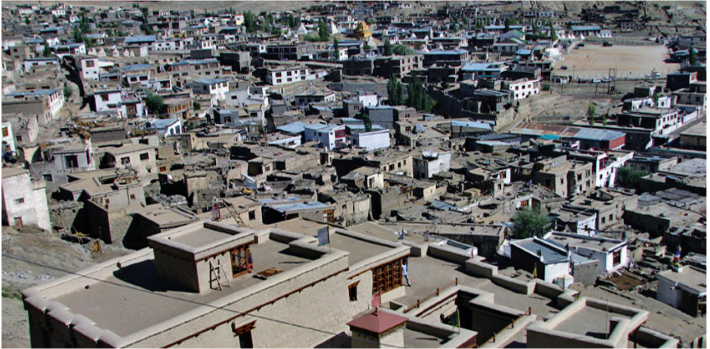
Bird's eye view of Old Town

Under the Liveable Leh project, two café-cum-public convenience has been constructed in Zangsti and New Bus Stand respectively to reduce the woes of public traffic, especially in the winters. And to decongest traffic, work has already begun on the one-way and pedestrian-friendly Changspa Street. The Liveable Leh team members have also submitted designs for a public park and other public spaces around Leh town. By the end of this project we believe to achieve all the targets under SDG 11 in the context of Leh and make Leh as a world-class liveable city and a sustainable tourist destination.