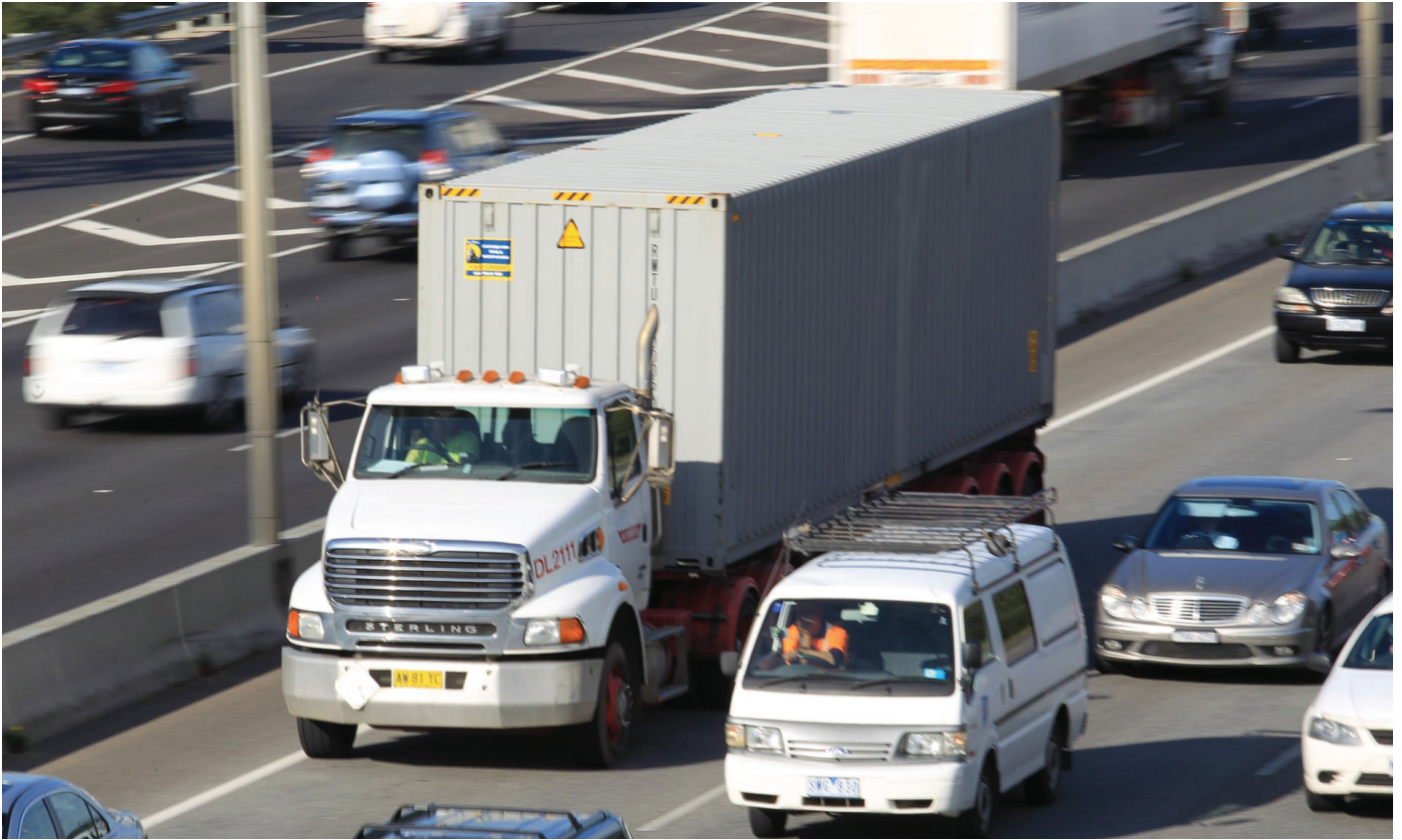
One of the Resilient Melbourne Citymart Challenge ideas makes it easier for parents to ask other parents for help juggling transport requirements