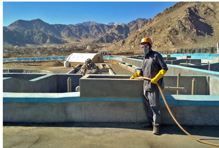
A group photo outside LEDeG Office, Karzoo

their fundamental right to not only get a fair compensation for the work they do but must be provided good protective equipment and proper training.