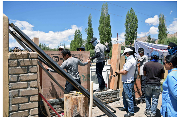
Putting up the Framework

The participants analysed the soil samples through sedimentation test by mixing soil samples in different jars. This helped them in calculating the sand, silt, clay and organic matter composition of the soil, which they later used in preparing the mixture for the rammed earth.