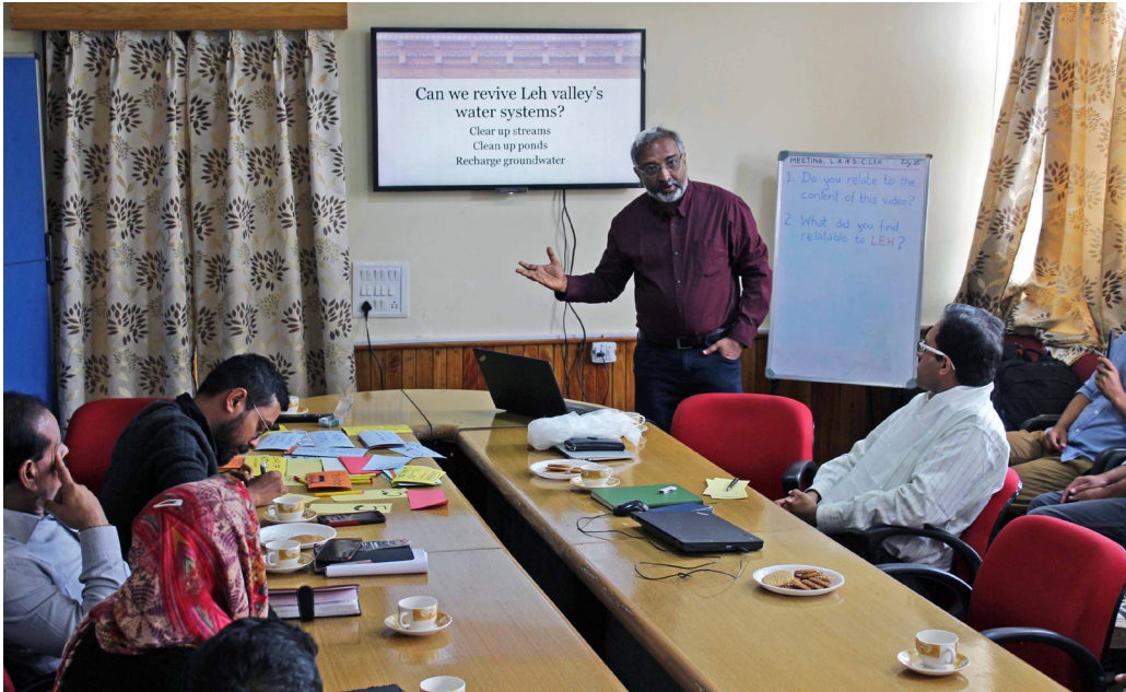
BR Balachandran interacts with the councillors and officers during the meeting at LAHDC Meeting Hall