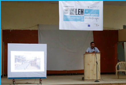
Page no. 4 Liveable Leh Talk Series 2,3 and 4