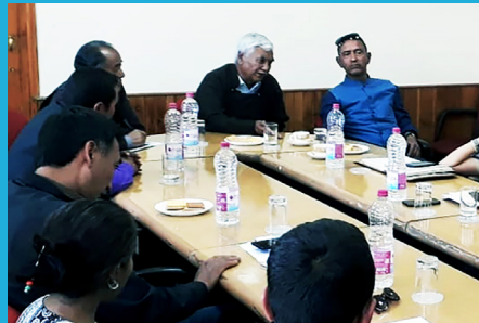
Page no. 7 Changspa Street Redevelopment Meeting