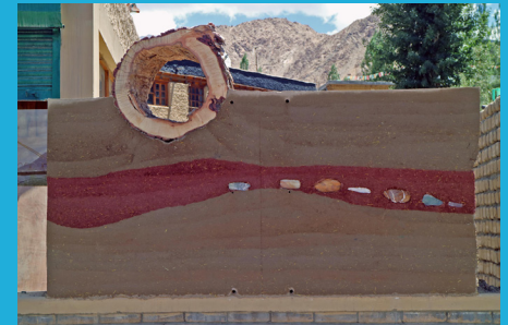
Page no. 9 Rammed Earth Workshop