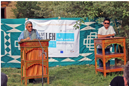
2 nd Talk With ALTOA and ALHGHA