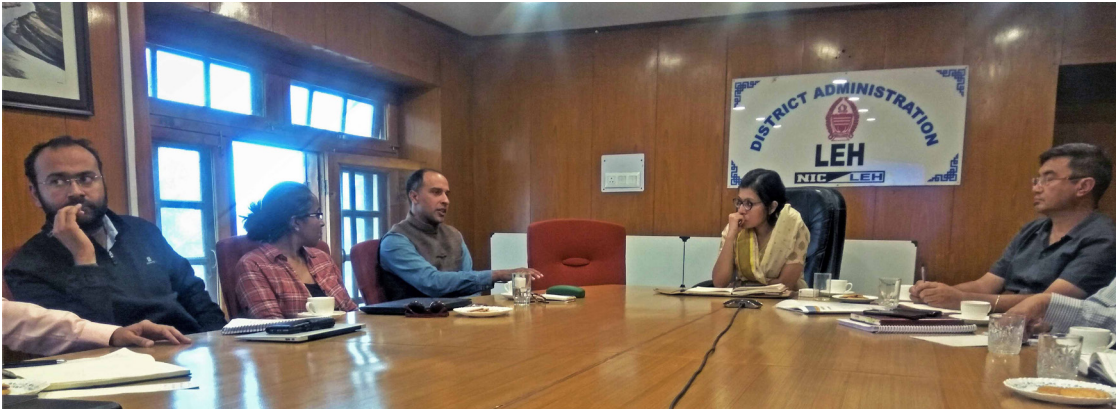
The meeting at DC's office in progress

Deputy Commissioner (DC) Leh Avny Lavasa called for a meeting on July 26 with the Water and Sanitation (WatSan) team from LEDcG to give a presentation on Integrated Water Management in Leh, and to provide information on the current water scenario in Leh.