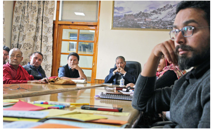
Chief Executive Councillor (CEC) LAHDC with other councillors and guests during the meeting