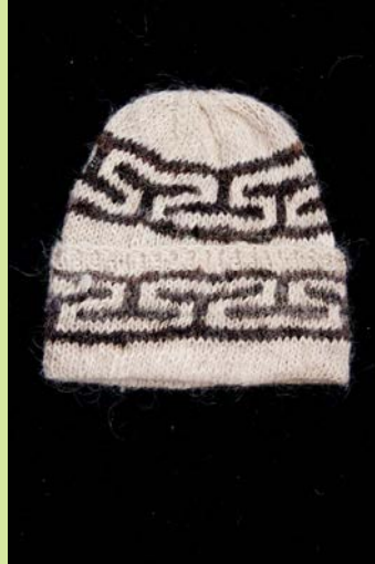
Woollen Folded Cap