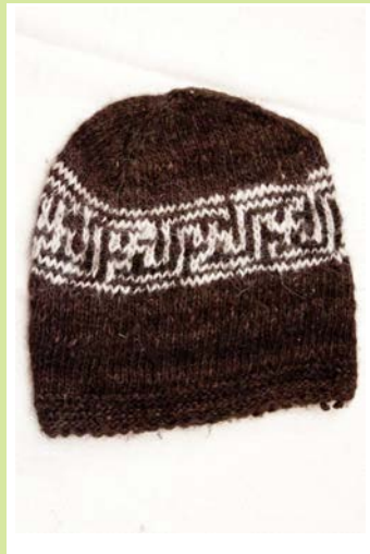
Yak Wool Cap