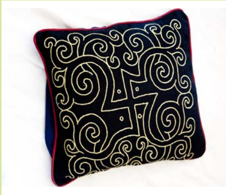
Embroidered Cushion Cover

Machine-made wool from Delhi. Cotton embroidery. Chemical dye. Various styles.