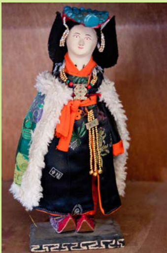
Ladakhi Traditional Doll

Silk, velvet, wood, and sheep wool. Hand painted. Various styles.