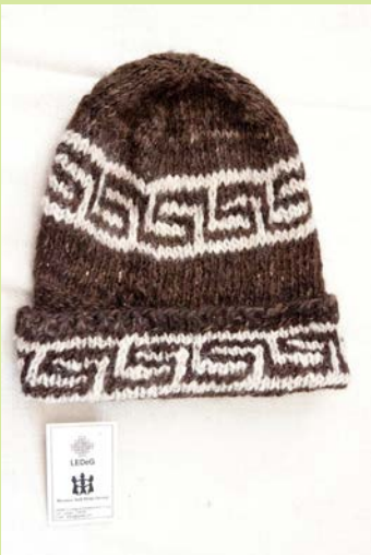
Yak Wool Folded Cap