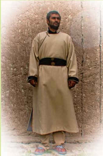
Ladakhi Traditional Men's Goncha