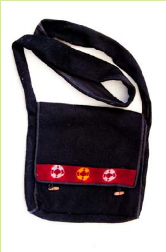
Nambu Poches Bag with Thikma

Machine-made wool from Delhi. Single pocket with button closure.