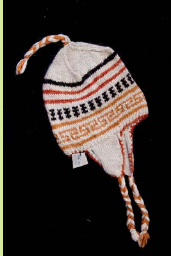
Woollen Cap with Earflaps

Price: 700 Rs/500 Rs (embellished/non-embellished)