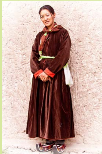
Ladakhi Traditional Women's Goncha