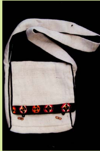
Nambu Bag with Thikma

Local hand spun wool. Single pocket with button closure.