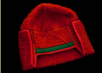
Zanskar Traditional Cap

Local hand knit sheep wool. Natural vegetable dye.