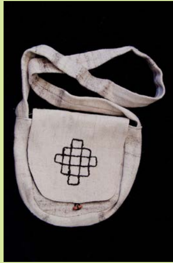
Nambu Bag with Spalpi

Local hand spun wool. Single pocket with button closure.